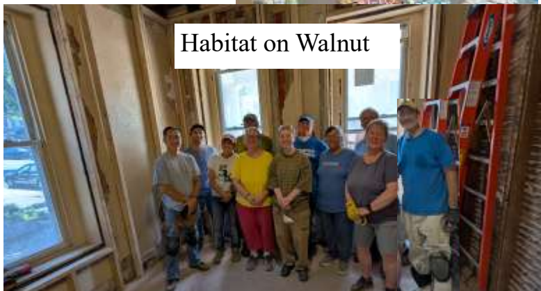
Habitat on Walnut