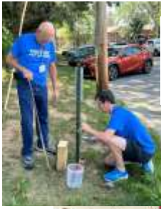
Church Grounds Clean-up