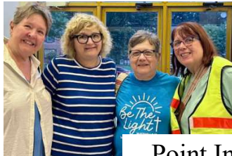
Point In Time Count