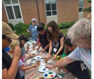
Spark Park Days