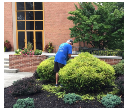
Church Grounds crew