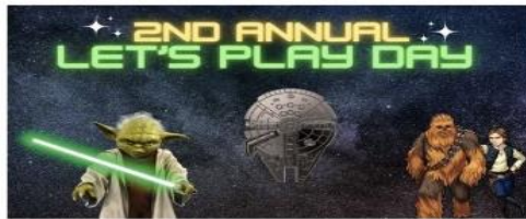
LET'S PLAY DAY MAY 4TH 10AM-2PM