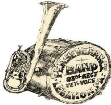
PERSEVERANCE BAND INDOOR CONCERT & RECEPTION APRIL 26TH 7:30PM