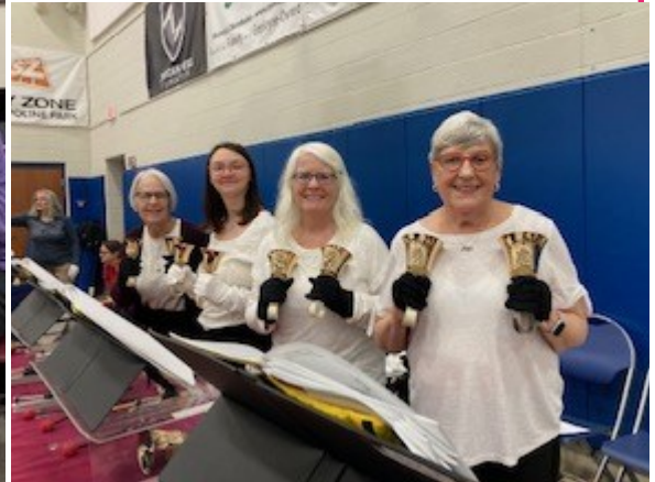
Here we are at the festival!